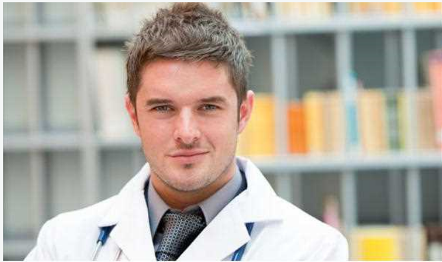
HemorrhoidsInternal HemorrhoidsExternal HemorrhoidsHemorrhoidBowel

Initial of all always keep the area clean, flush with clean water following every bathroom visit and use towelettes instead of toilet paper.