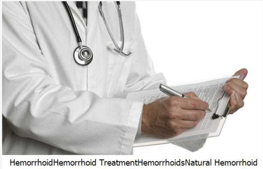
HemorrhoidHemorrhoid TreatmentHemorrhoidsNatural Hemorrhoid

Four Markers of a Good Hemorrhoid TreatmentBy: Indicate Ferrer | 05/01/2010 | Diseases & Conditions