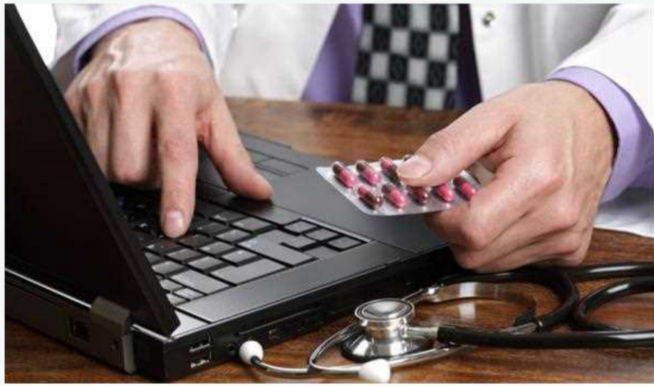
Cure Bleeding Piles

Sitz bath External hemorrhoids need to be handled carefully and thoroughly by using a sitz bath of warm water for 10 or 15 minutes. You can do this by sitting down with your knees raised in three to four inches of warm water in a bathtub or a basin. The warm water can provide a quick relief from the swelling and pain caused by external hemorrhoids plus the warm water can shrink the swollen rectal veins. In addition, the therapeutic effect of moist heat in the rectal and rectal places can cure the affected tissues and protect the healthier ones.